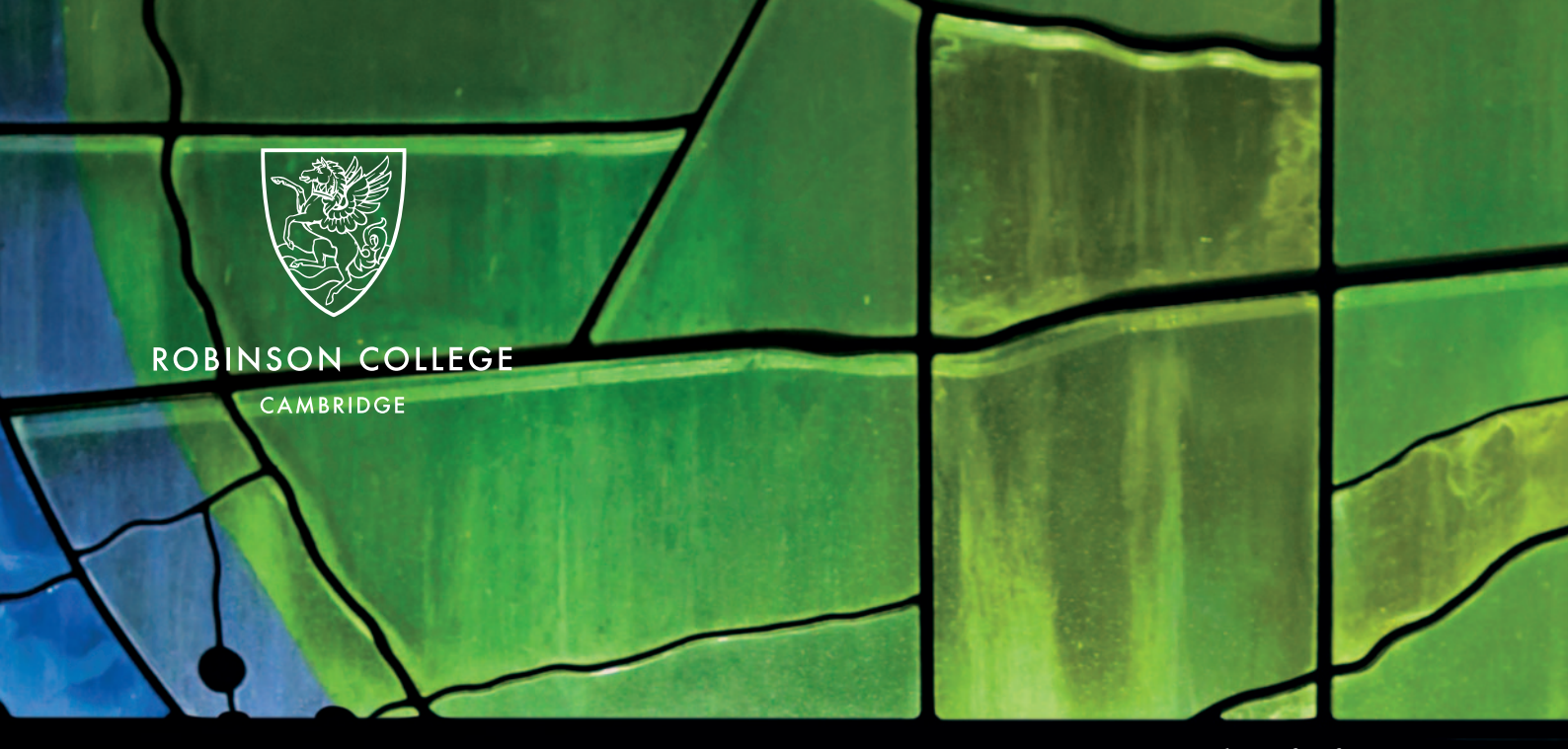
REMEMBERING ROBINSON The gift of a Legacy