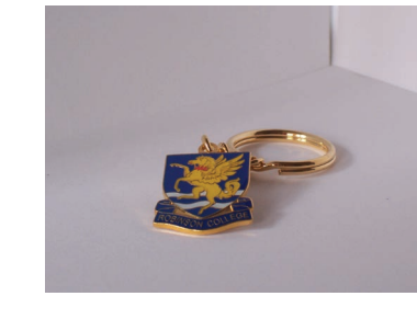
Enamel Key-ring £4.50

Robinson College by Hilary Gibson, pack of 10 notelets with envelopes: £7.50