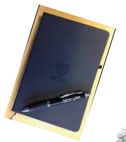
Black lined notebook and pen: £8.50