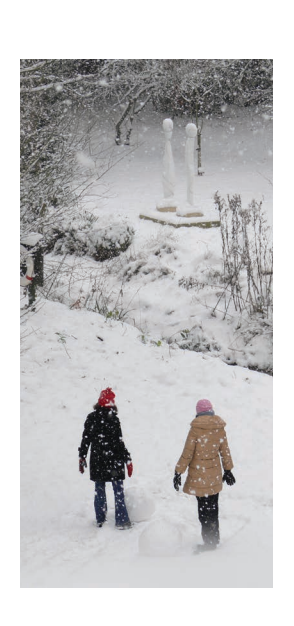
Conversing Figures, pack of 10: £4.50

The text in all these cards reads "Season's Greetings".