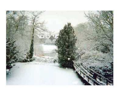
Thorneycreek in the snow, pack of 10: £4.50