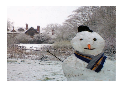
Snowman pack of 10: £4.50