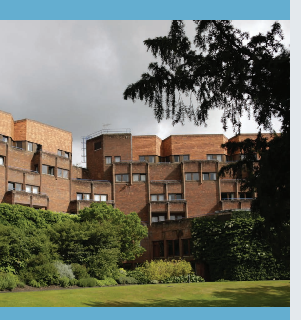
Photos: Cover, Robinson Gardens, the Sundial of Seasons; This page, top to bottom: Reflection; WI May Crew; View from the Bridge.