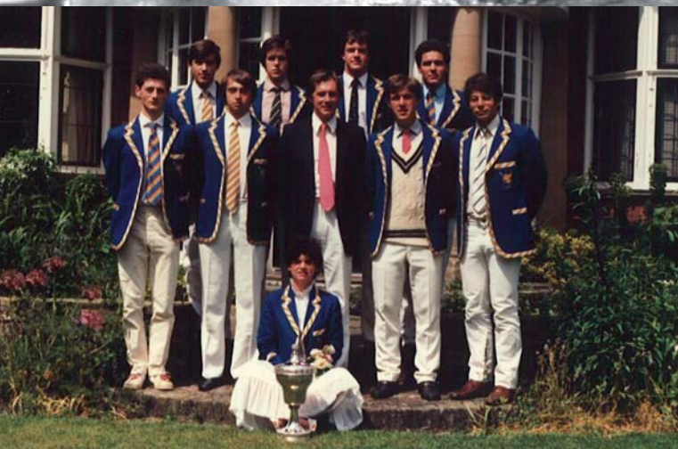
Figure 3: The boat club performed particularly well this year, claiming the Mitchell cup, to be recognised as the most successful college boat club across the year