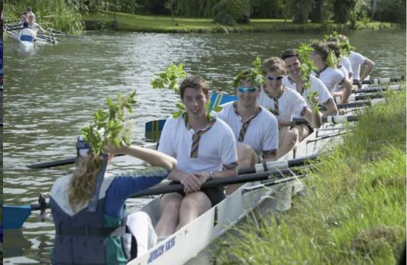
Figure 5: The customary greenery after another successful bump!

cox. Before we could blink, Lent Bumps 2003 was upon us as a very inexperienced, nervous yet hopeful 'Binson crew paddled up to the start.