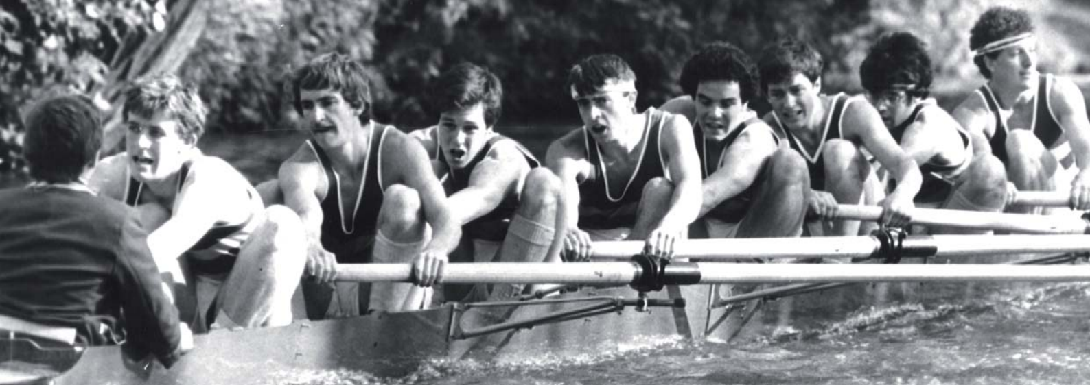
Figure: 2 The 1982 May boat in full flow.