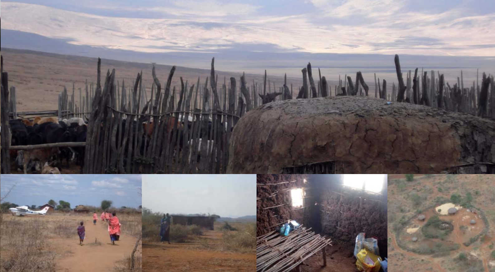
Opposite page: TJ & Pat (pilots), Peter and me. This page, starting at the top going clockwise: Maasai hut, view of Maasai settlement from the plane, the clinic room with examination bed and supplies, Maasai woman and child outside the clinic hut, Maasai women and children coming to clinics.

the foetal heartbeat using a small hand-held ultrasound probe. Nearly all the women we saw appeared to be healthy with normal pregnancies or only minor complaints, which was great to see.