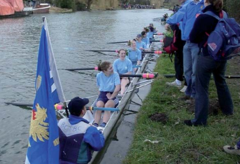
Figure 4: The 1st ladies pick up the flag and their greenery after their fourth bump, their bank party looking on.