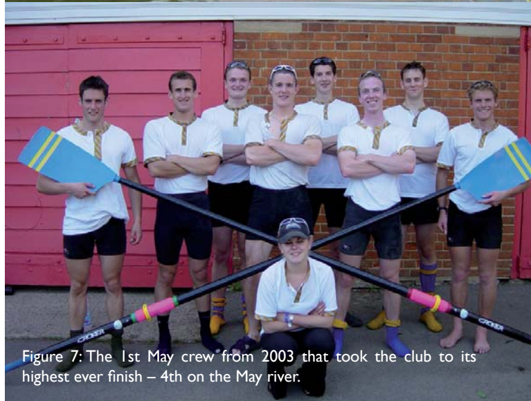
Figure 7: The 1st May crew from 2003 that took the club to its highest ever finish – 4th on the May river.

June 2011. Over the past 30 years, RCBC has grown in to a vibrant club which has regularly challenged the top crews on the river. We hope that the 30th Anniversary will provide an opportunity for former members from all eras to come back, meet old crew mates and get to know the current generation of 'Binson rowers.