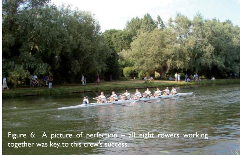
Figure 6: A picture of perfection – all eight rowers working together was key to this crew's success.

Robinson College Boat Club and the Old Blades Society would like to invite you to join them for the club's 30th Anniversary Dinner on Saturday 18th