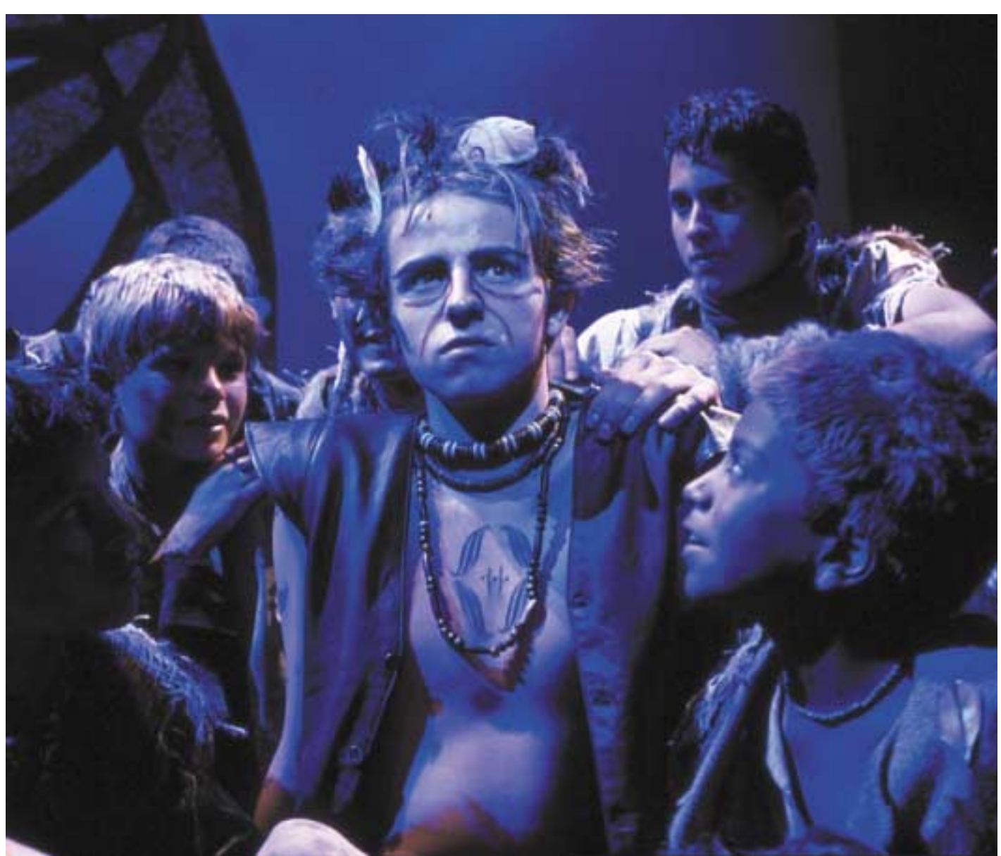
National Youth Music Theatre cast members in The Dreaming