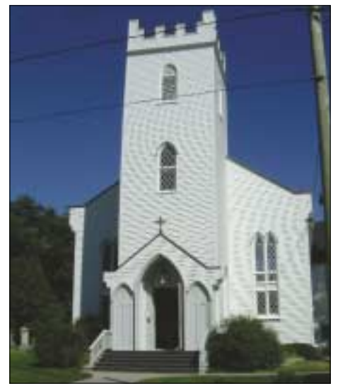
St Mark's Church, Port Hope

Port Hope, a tiny remote community with its wooden parish church, the oldest in Ontario, was our next venue for a September 11th memorial concert. We