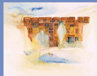
The Mystery of Communion 2002 S. Edwards-McKie

The oil painting The Mystery of Communion by Susan Edwards-McKie is offered as the Robinson College Christmas card for 2003. Cards are available at £4 per pack of five different designs. Individual cards are also available at £1 each. Payment can be made by cheque or credit card.